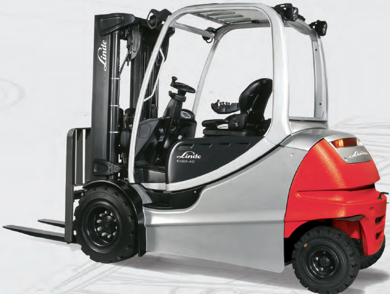
RX60-40, RX60-45, RX60-50, and RX60-50/600

Over 400 employees in our research and development group assure continuous product improvement and development of new technologies .