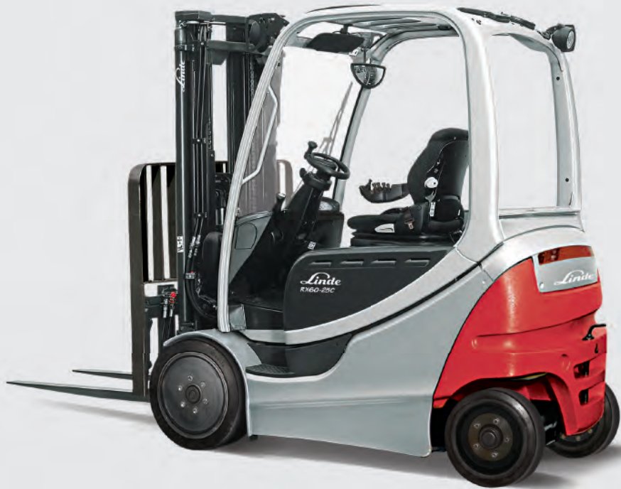
RX60-25C and RX60-30C