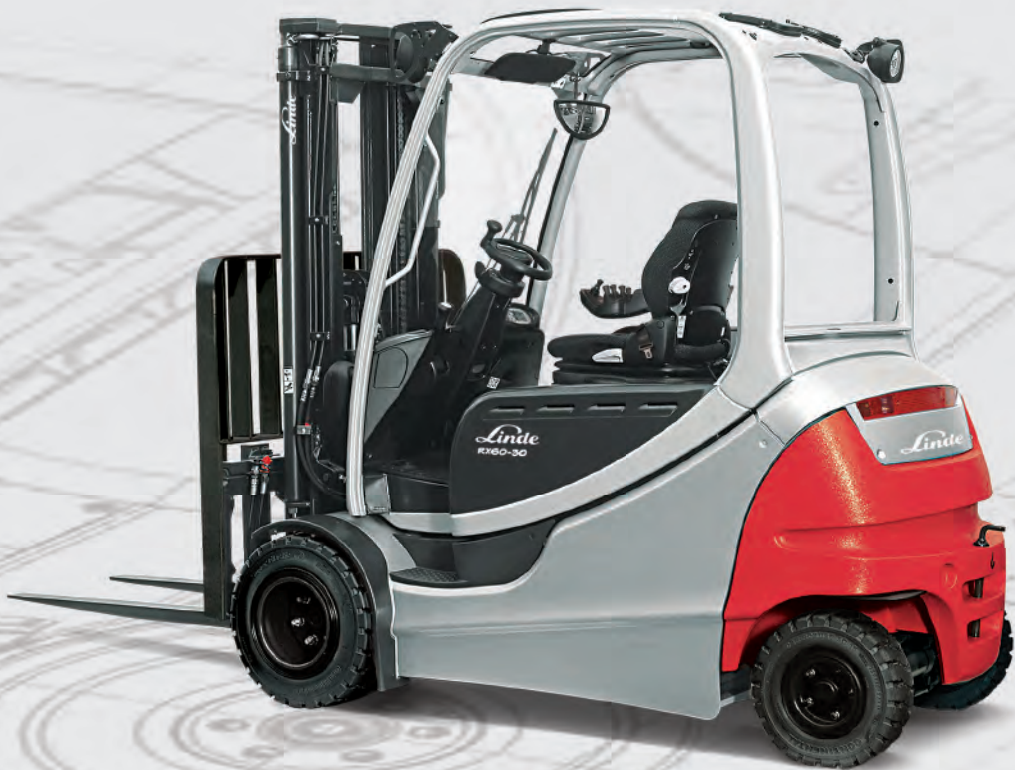
RX60-25L, RX60-30L, and RX60-35