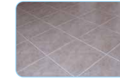
Small Square Brick Flooring