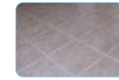
Small Square Brick Flooring