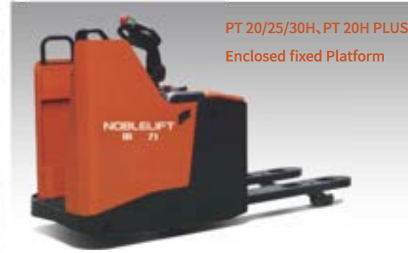
PT 20/25/30H, PT 20H PLUS Enclosed fixed Platform