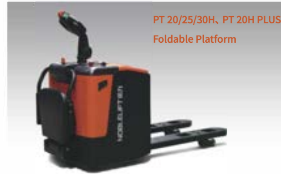
PT 20/25/30H, PT 20H PLUS Foldable Platform

The power lithium battery system is composed of high-safety high-density lithium iron phosphate battery, intelligent battery management system (BMS), thermal management system, and automotive-grade DC high-voltage control system. BMS enables the communication network between the power lithium battery and controller, the truck itself, the charger and the remote management platform, real-time detection of the status of the lithium battery, the operating state of the truck and the charging state, so as to maximize the safety and reliability of lithium batteries.