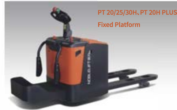
PT 20/25/30H, PT 20H PLUS Fixed Platform