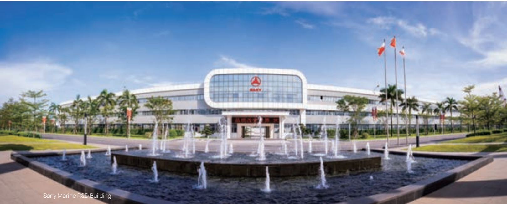
Sany Marine R&D Building